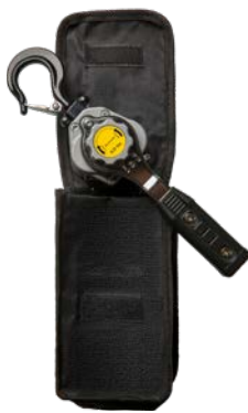
0,25 - 0,5 ton