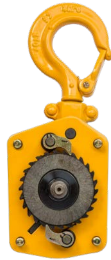
Standard brake disc