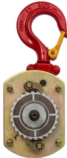
Extremely durable steel brake disc with sintered brake pads