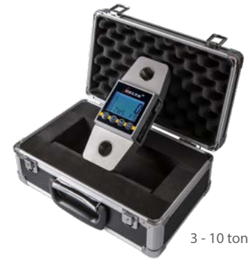
3 - 10 ton